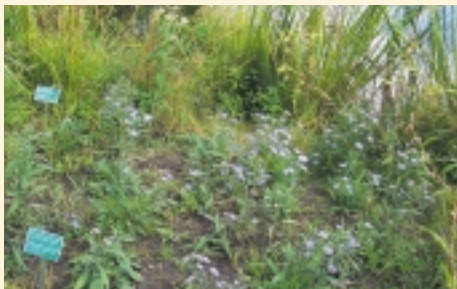
Cultivating species-at-risk: Montreal Botanical Garden