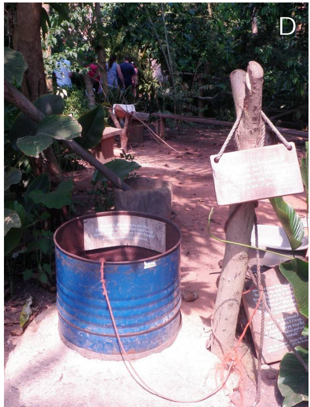
Fig 2. The Bantaba area in the Rainforest Biome, Eden Project, illustrating (A) overview of the seating area, with stripy kettle at bottom right; (B) adjacent chop farm; (C) the kitchen area; (D) the well, with descriptive signs from village voices.