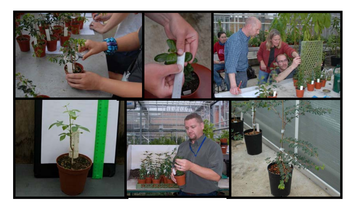
Figure 4: UKOT Programme staff and volunteers carry out the final recording