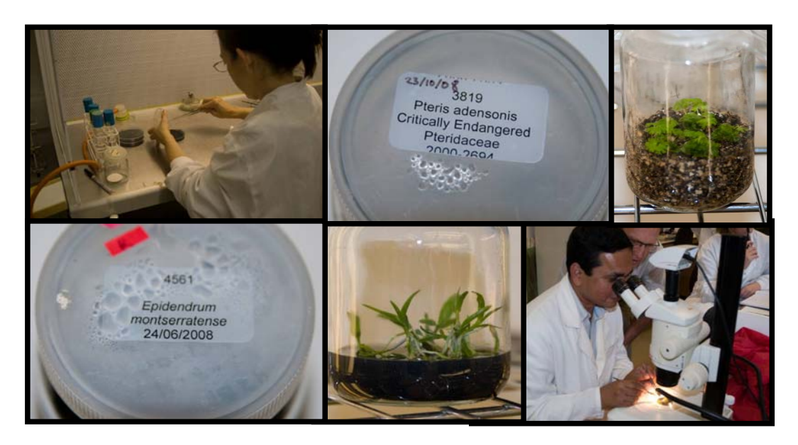
Figure 5: Species requiring specialist treatment in the micro-prop unit at RBG Kew