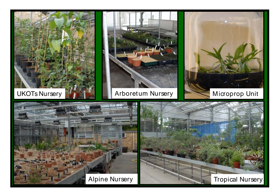
Figure 3: Range of nursery facilities at RBG Kew