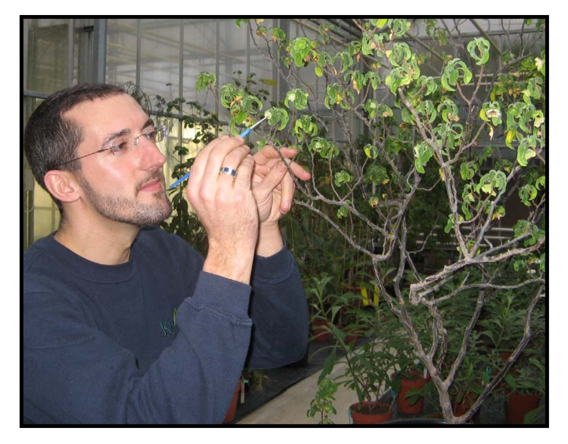
Figure 6: Hand pollination of Mellissia begoniifolia in the Tropical nursery at RBG Kew.