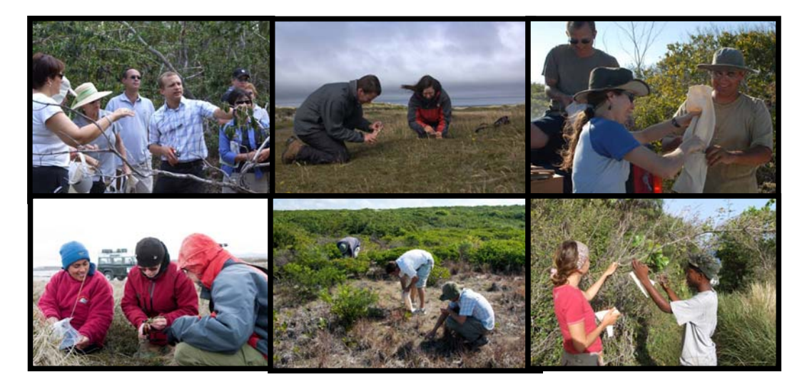
Figure 2: Field activities supporting in-situ conservation