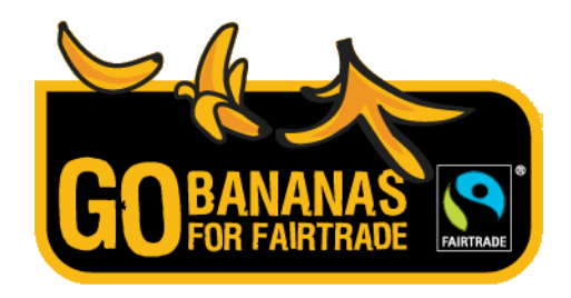
Fig. 4 Fair trade logos

Story telling has a big impact on helping children understand some complex issues. The idea of 'fairness' is easily grasped by even the youngest child – he or she understands immediately how a cake is divided or sweets are shared out amongst a group. So that whilst the idea of 'trade' and how this works may be a concept too far removed from young children's experiences the idea of 'fair trade' can make perfect sense. At CUBG a workshop on how bananas are grown and distributed has been prepared in a simple way to encourage children to think about equity and how to achieve it. The focus is on the bananas grown in the Caribbean.