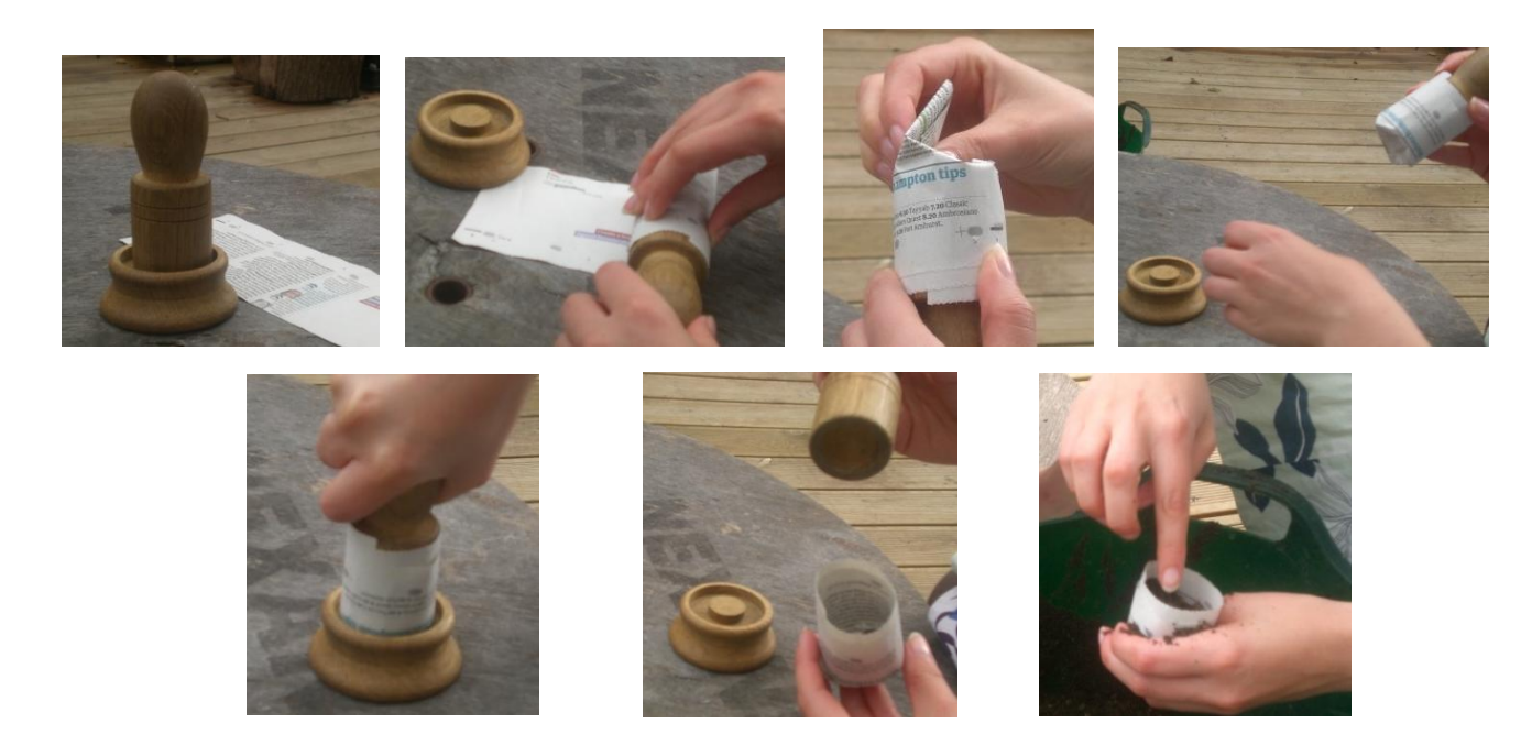
Fig.2 Making newspaper pots

The primary workshop consists of an introduction to seeds, their structure, where they develop in a plant, how they differ depending on the type of plant and how they germinate. The children are asked to consider