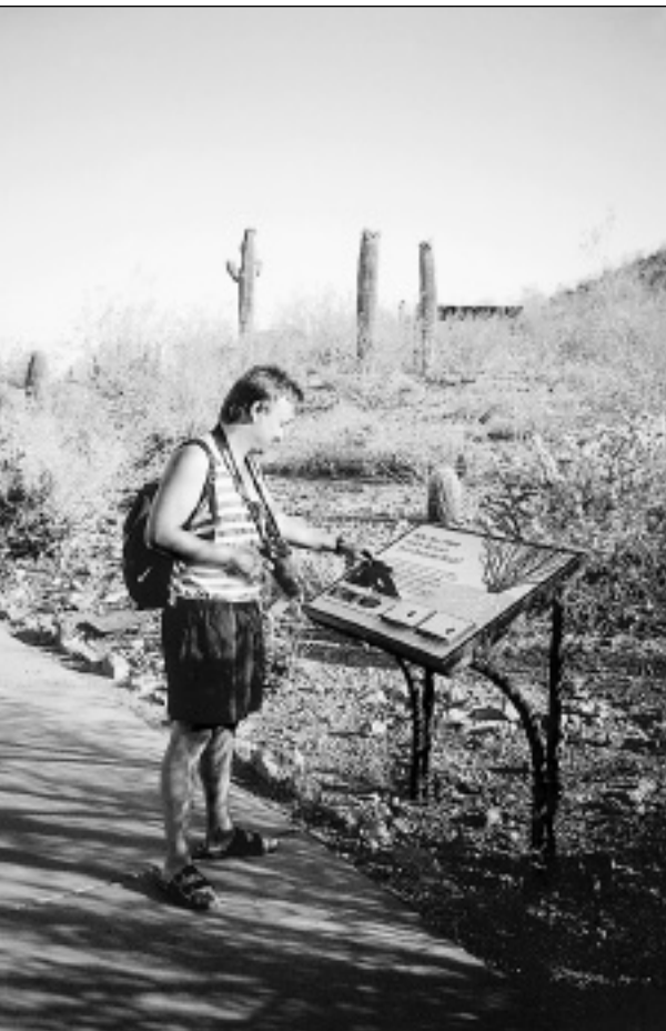
The question on this sign has effectively aroused this visitor's interest and curiosity. (Desert Botanic Garden, USA)

A simple way to engage visitors is to pose a question on the sign and to put the answer and explanation under a flap. This technique is most effective if it's a question that visitors have asked themselves (and not something obscure that you think people should ask!).